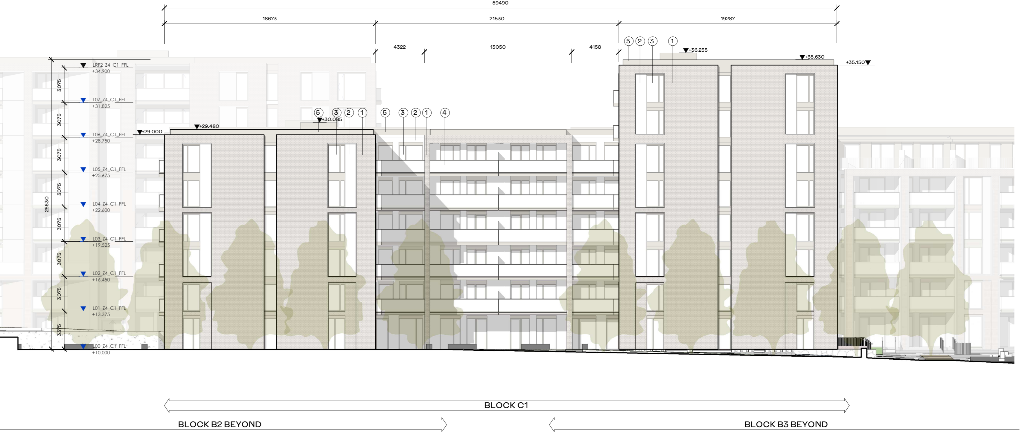
3 Block C1 Proposed South Elevation 1 : 200