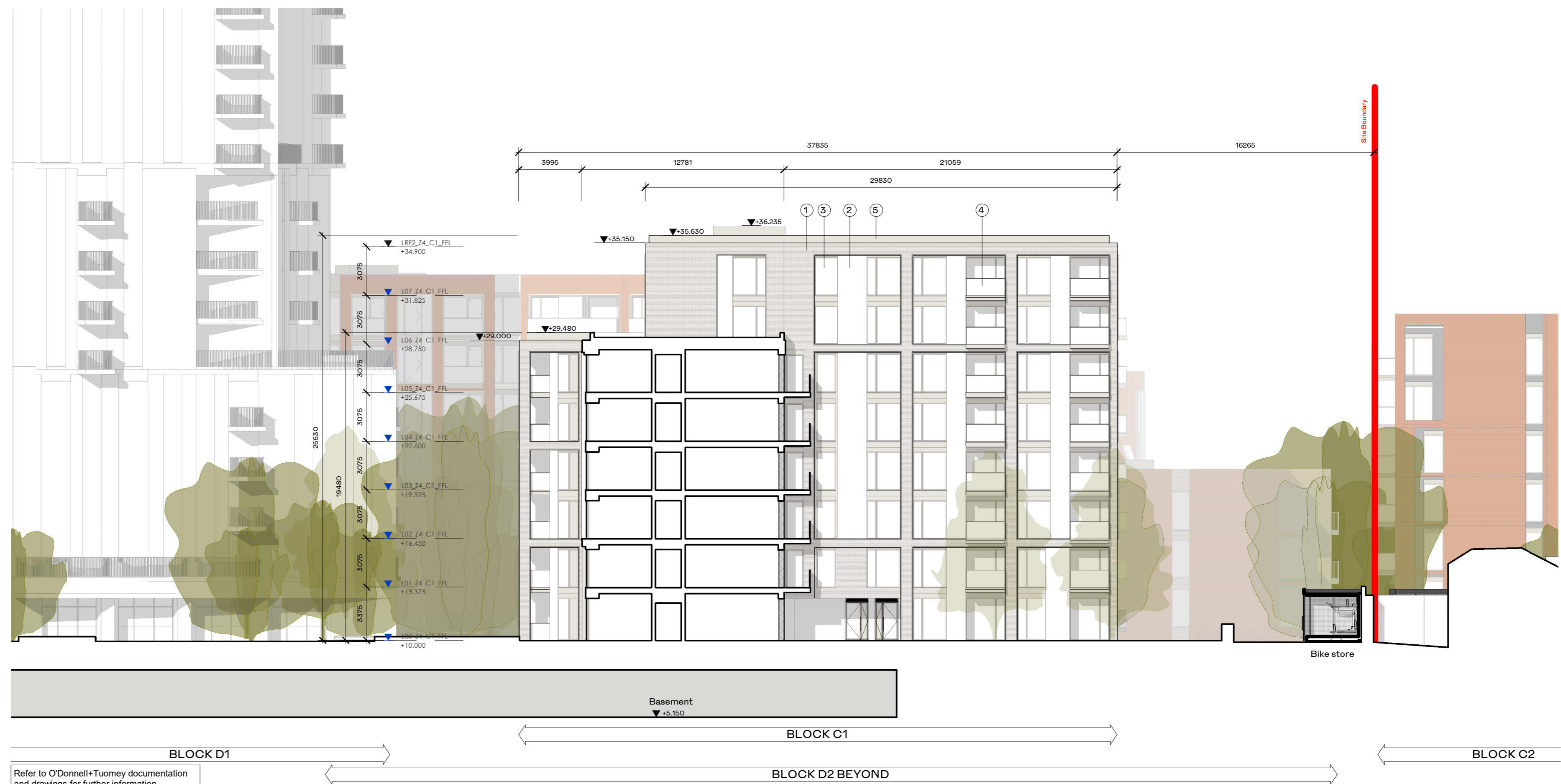
6 Block C1 Proposed West Courtyard Elevation 1 : 200