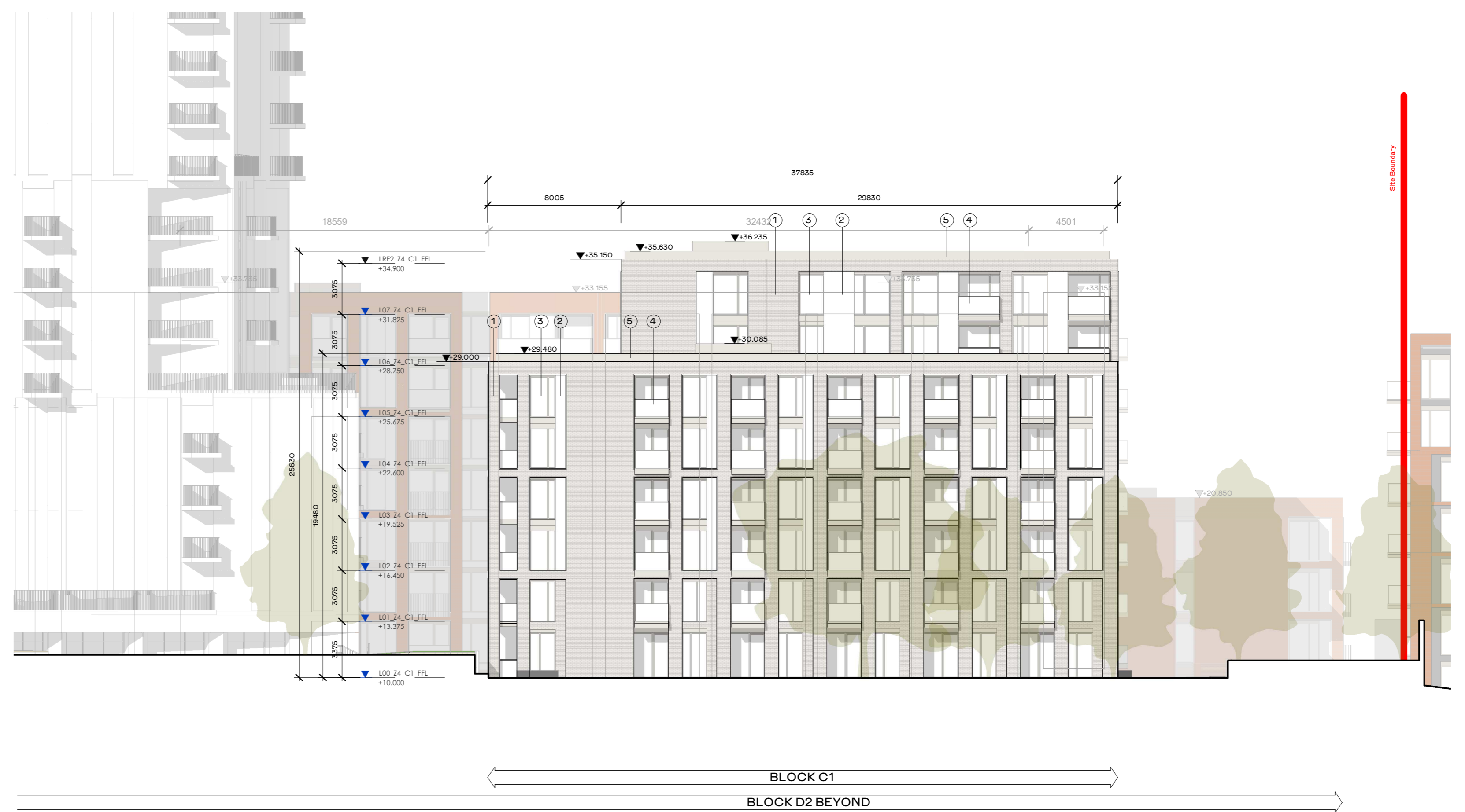
2 Block C1 Proposed West Elevation 1 : 200