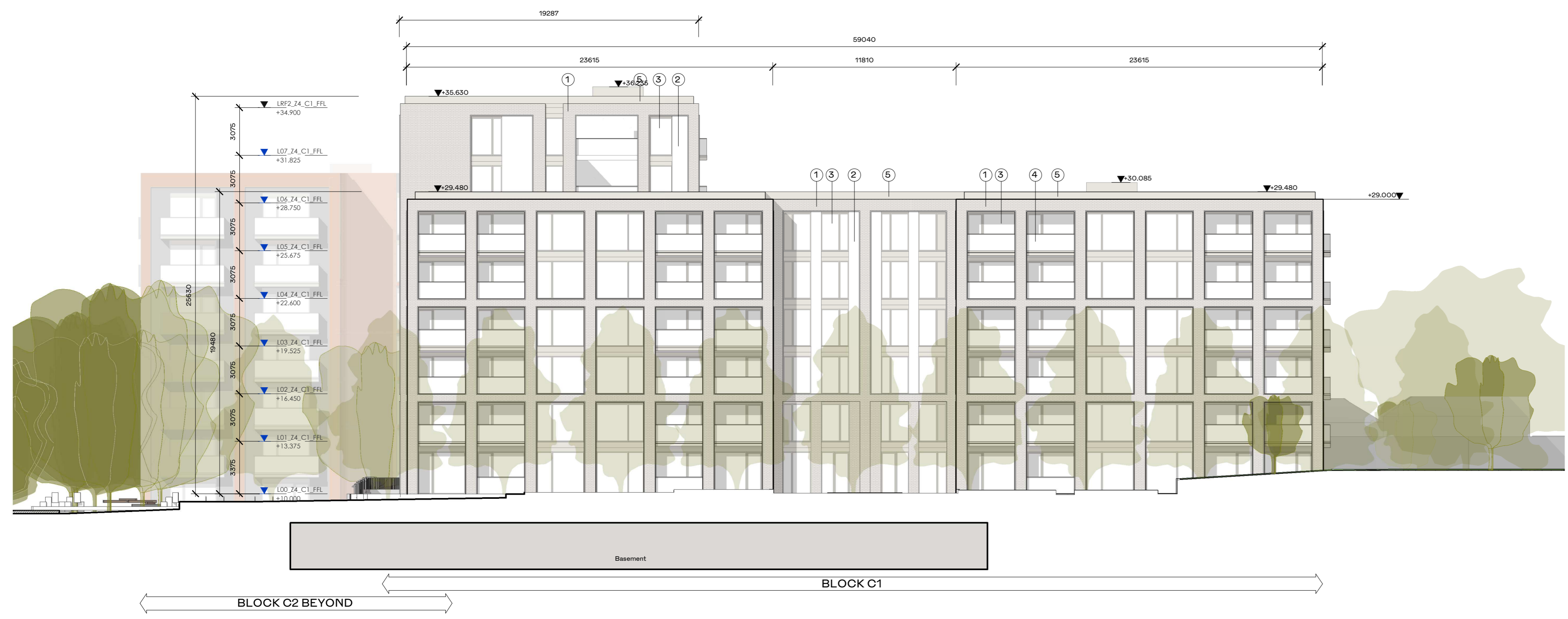
1 Block C1 Proposed North Elevation 1 : 200