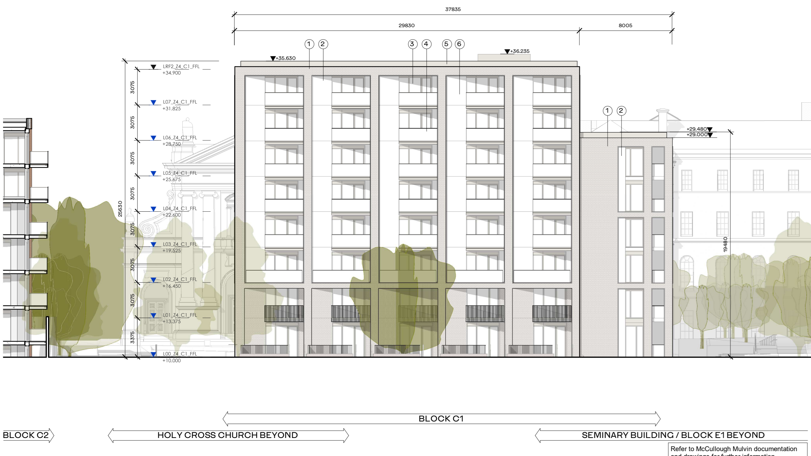
4 Block C1 Proposed East Elevation 1 : 200